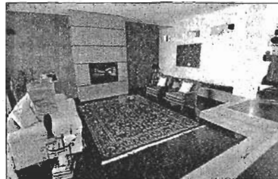
The 2,600-square-foot home (above) is unique, featuring a sunken living room (below) with painted concrete floors. It's sandwiched between small mill houses and within walking distance of the NoDa arts scene.

It's the contemporary home she always wanted, a one-of-a-kind that slows traffic